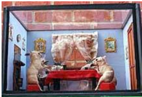
The 'Baby Rabbits playing cards' are actually Brown Rats!