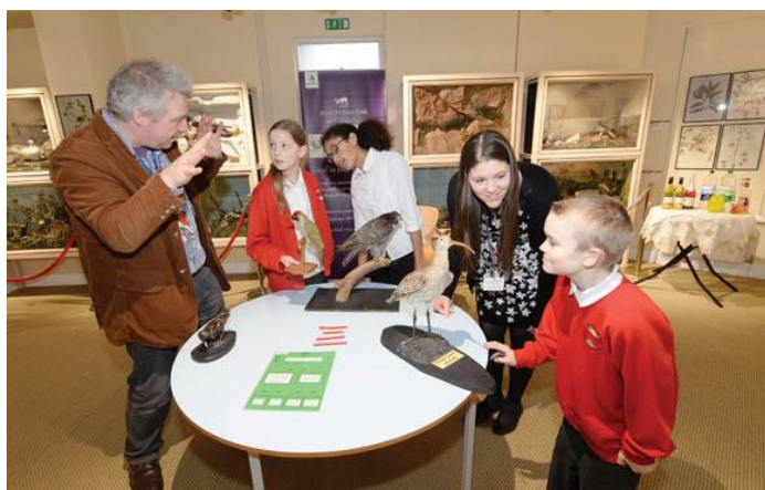
Red Barn Primary School Year 6 children at the opening of Stuffed and MOUNTed

The CEL Team have reviewed the school sessions to align them to the new National Curriculum and have written and produced a new primary schools' brochure to promote the service, which has been sent to every primary phase school in the borough.