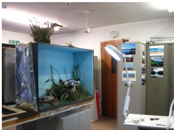
Each case was cleaned inside and out

The research, text writing and extensive conservation work for the 'Stuffed and MOUNTed' exhibition was completed by the Collections Team in October in time for the 14 cases of taxidermy from the Thomas Atkinson Cotton Collection to be put on display at the Museum in January following exhibition at Eastleigh Museum. This is the first time they have been on display to the public for 60 years, having been tracked down in Norfolk and brought back to Hampshire by the Arts and Museums Service.