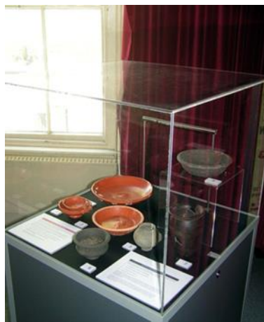
Hampshire 'grave goods'

This was replaced by an archaeology-based display featuring two distinctive types of Roman pottery, glossy red samian from Gaul and grey-black wares made near Farnham, which ended up in a series of cremation burials found at Neatham, near Alton. A comparatively local tradition saw many vessels placed in single grave (63 in one instance!). Some were family heirlooms, mended with lead rivets, others were low-grade 'kitchen rejects' probably made for the funeral market. The burials date from around AD 150. Hampshire's Hidden Treasures are designed to illustrate the diversity of the collections cared for by Hampshire County Council and that are available for exhibition at Westbury Manor Museum.