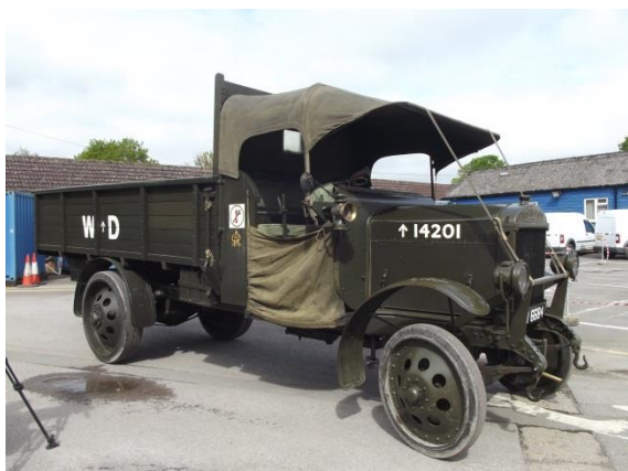
At Chilcomb before being put through its paces for the BBC South team