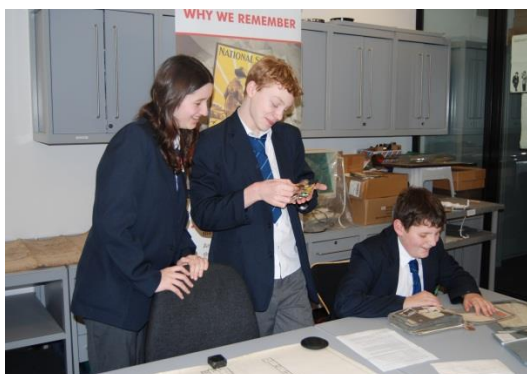
Crofton students at work with WW1 collections

Another very successful school activity was the Mini Museum project with Red Barn Primary School. The ACELO helped Year 5 pupils to set up a museum at school and a mini exhibition in the Resource Room at Westbury Manor. The project involved the children evaluating the displays at Westbury, becoming curators, and gaining the skills to create their own display and associated activities for visitors. They chose World War II as their subject, undertook research and borrowed objects from the school community to display. They produced information panels, object labels, games and activities. They even had their own private view event for their families! Over 400 visitors saw their exhibition in the museum in April.